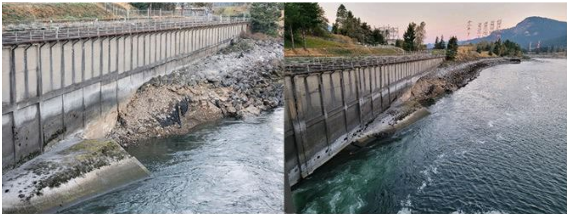
Photo 1: Left frame, close photo of damage to the B-Branch Fish Ladder apron. Right frame, overall photo of the damage.

On 15 September 2022, after flushing trash through Spillbays 1 & 18, project personnel observed erosion on the riprap apron of the B-Branch Fish Ladder on the south shore of the spillway tailrace ( Photo 1 ). This erosion was further confirmed by an ROV, hydrosurvey, and land survey (as coordinated in 22BON089 MOC & MFR 22BON094 & 23BON005 ). The erosion undermines the structural integrity of the ladder. The repairs on the riprap will begin 19 February 2023. Failure to repair may result in having to close the B-Branch ladder to avoid structural failure and modify spill for juvenile fish passage in April 2023. The contractor needs a two-week extension of the in-water work period to complete the repairs.